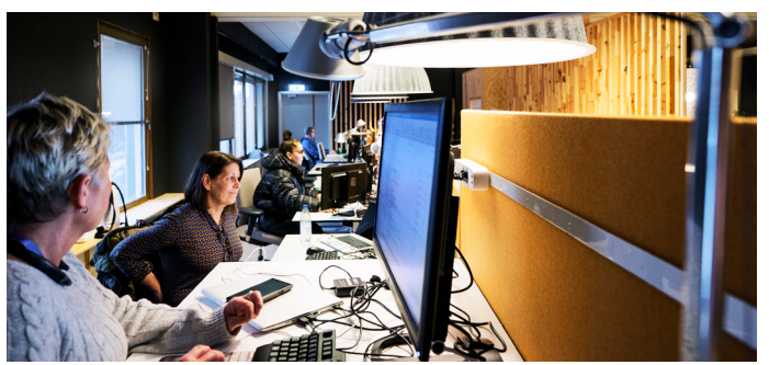
Mistra SAMS jobbhubb i Tulllinge

Design interventions in the living labs are used to gain knowledge on how users respond to a combination of accessibility and mobility services together with policy instruments. We provide a combination of services via a digital platform and test it in different urban contexts. The purpose of the living labs are to encourage businesses, researchers, authorities, and citizens to work together for the creation, validation and testing of new services, business ideas, markets and technologies in real-life contexts.