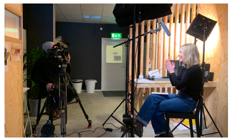
<u>Watch our short film about the Tullinge work hub</u>

The living lab in Tullinge has been sustained and re-opened after the Covid restrictions was cancelled. A workshop with stakeholders interested in scaling up the work hub have been held. As a result of this, the hub will continue to be open for users and will be managed as a pilot project in co-operation with KTH, Botkyrka kommun and Vakansa.