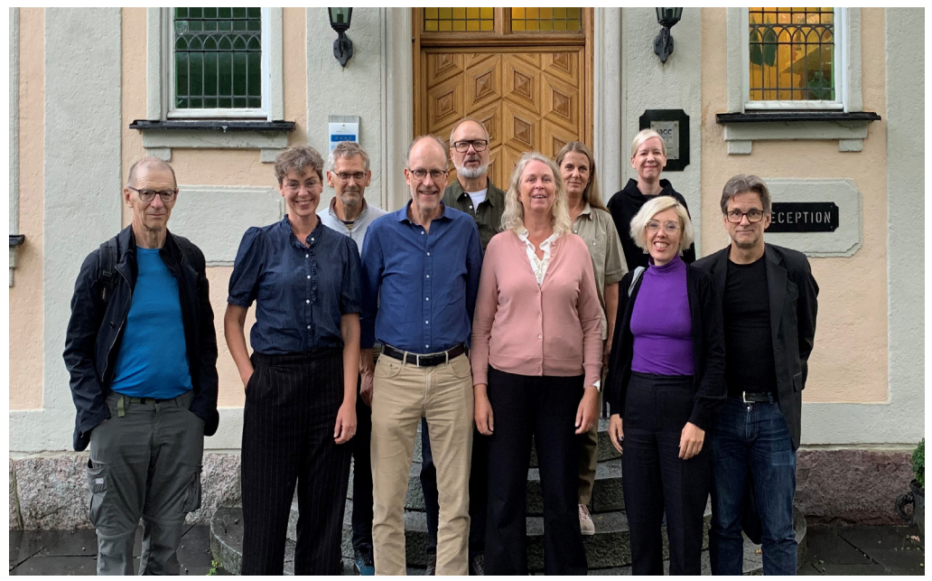
Mistra SAMS management group meeting August 2021