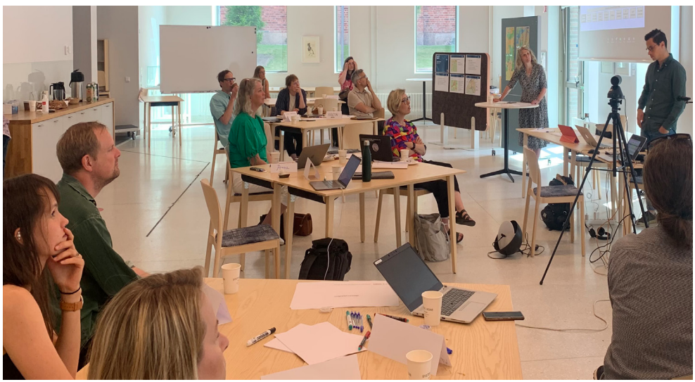
Listen & co-create workshop, September 2021, photo: Mistra SAMS