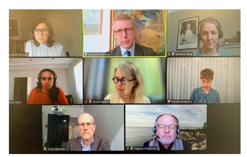
Panel conversation about mobility in cities after Covid-19

<u>"Slutsniffat i andras armhålor" an article about</u> the result conference at mistra.org