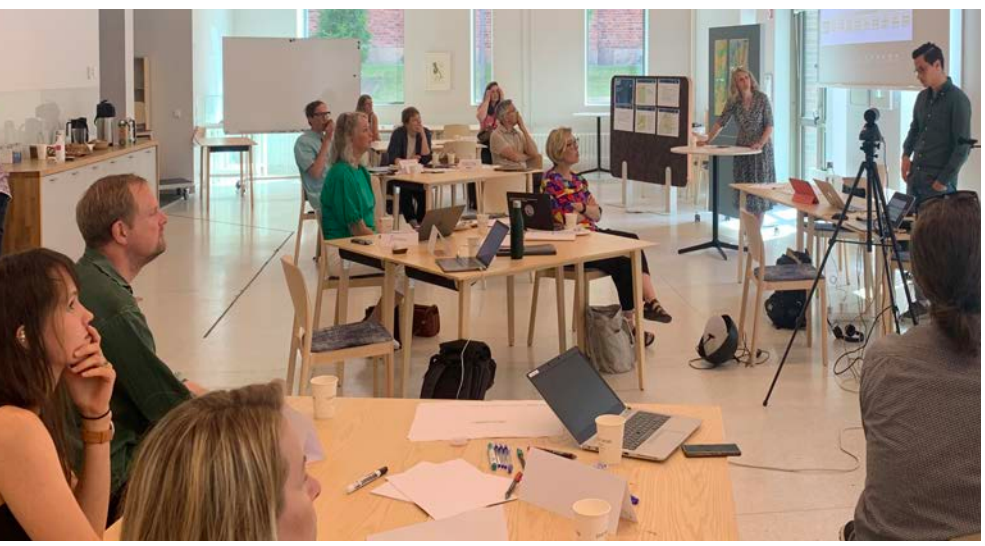
Listen & co-create workshop, September 2021