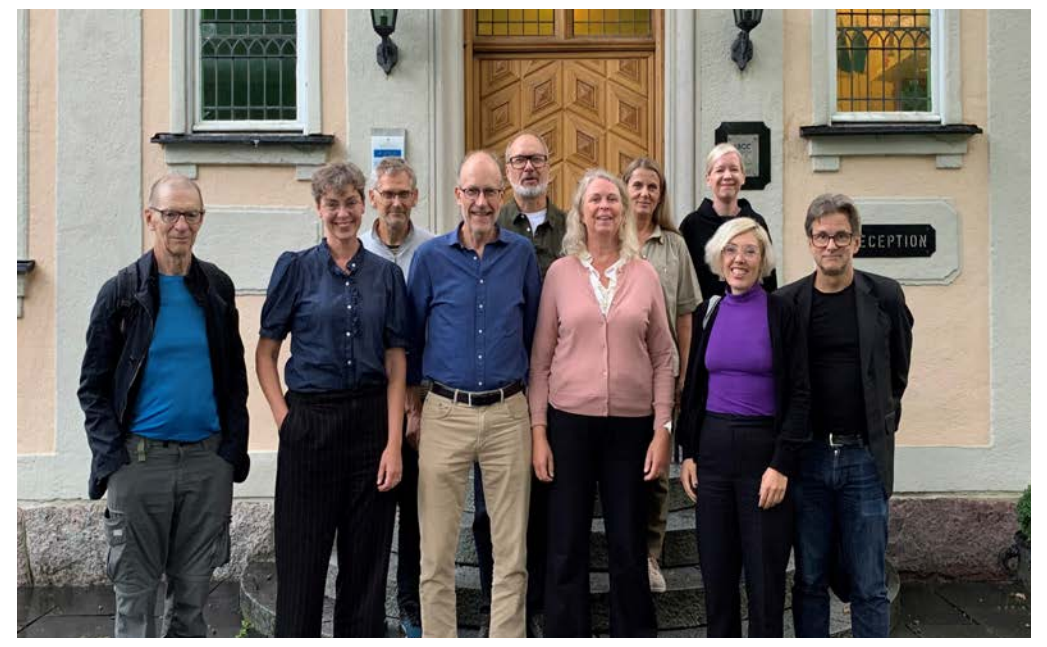
Mistra SAMS management group meeting August 2021