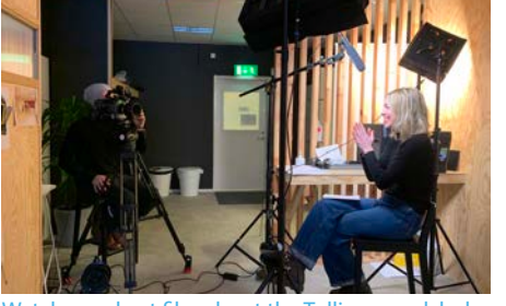
Watch our short film about the Tullinge work hub

The living lab in Tullinge has been sustained and re-opened after the Covid restrictions was cancelled. A workshop with stakeholders interested in scaling up the work hub have been held. As a result of this, the hub will continue to be open for users and will be managed as a pilot project in co-operation with KTH, Botkyrka kommun and Vakansa.