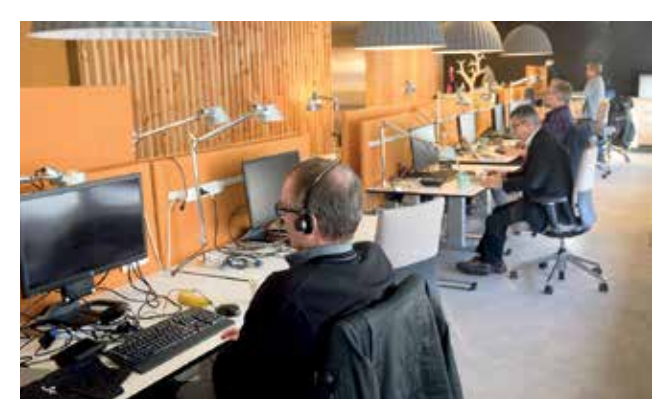
The co-working hub in Tullinge.

Finally, Mistra SAMS will explore how the increased use of digital services may influence emissions and energy footprints.