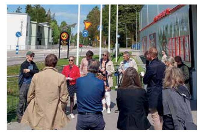
Consortium meeting in Riksten, May 2022.

2022 was also the year for finalizing the pilot project on commercialization of local job hubs together with Botkyrka municipality and the Vakansa space-sharing initiative. Researchers and other partners in the program have contributed to the public debate by sharing research with public investigations, participating in conferences and seminars, publishing opinion pieces, and generally raising issues related to the need for a more transport-efficient society so that climate goals and social equity can both be achieved.