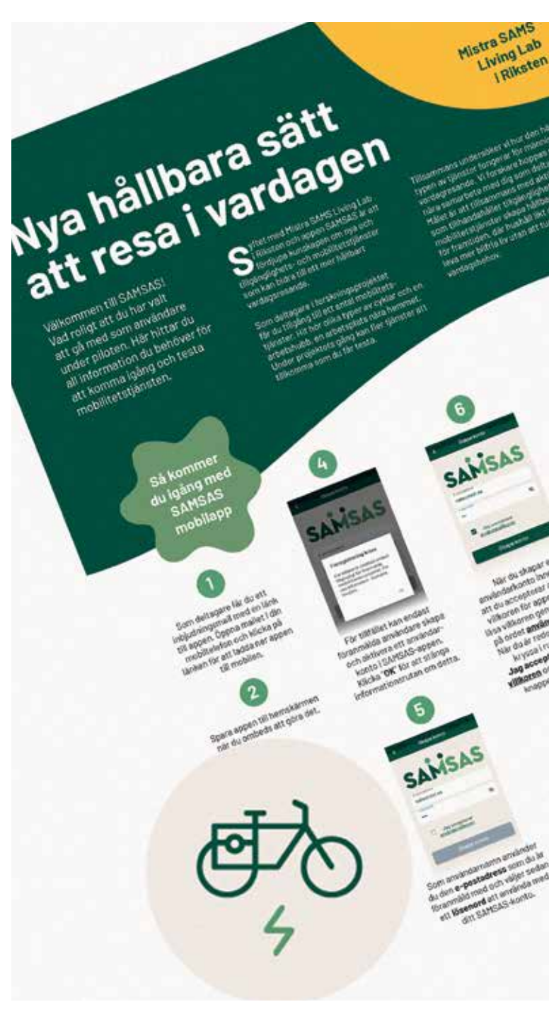
The visual identity of the SAMSAS-app.

All in all, fourteen co-researchers living in Riksten were engaged to take part in the living lab. Through a smartphone application that we developed and launched for the living lab (SAMSAS), these participants have access to electric bicycles placed strategically in Riksten and to a co-working hub in nearby Tullinge. The participants have also set individual goals to reduce car use and will track their car journeys using the app.