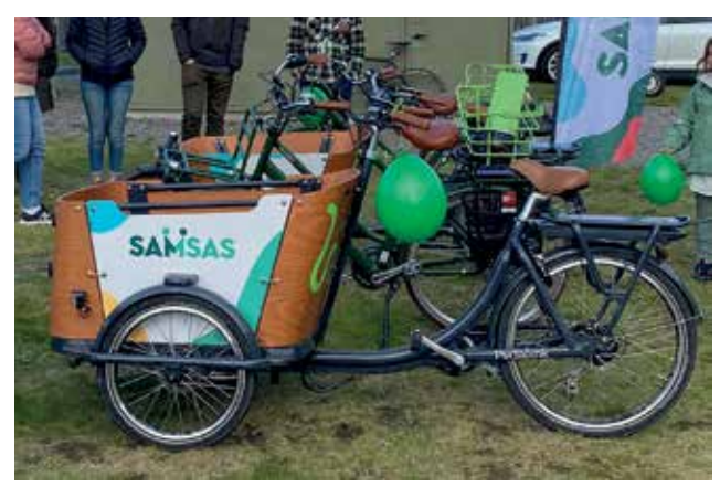
Living Lab Riksten opened in September 2022.

In 2022 we conducted two workshops with key stakeholders in Botkyrka municipality. In the first workshop, we explored which methods could be suitable for promoting sustainable mobility and accessibility in Riksten. The workshop showed that citizen participation (such as participating in a living lab, being interviewed, or attending public hearings)