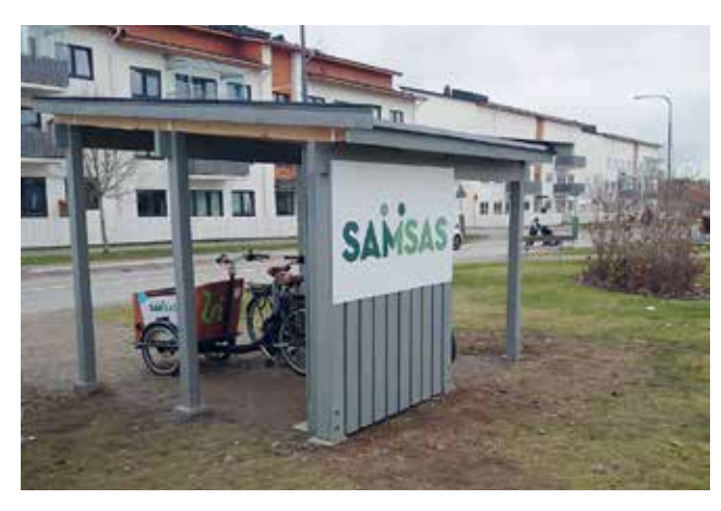
The bicycle shed where the bikes are parked and charged.

In 2022 we studied the relationship between experimental processes carried out in Mistra SAMS and the municipality's strategic planning and governance of Riksten's developments. We identified conditions which limited the use of knowledge gained from experiments (such as lack of up-to-date urban planning strategies and limited strategic planning resources directed towards Riksten's development) which demonstrate the challenges of learning from urban experiments "beyond the flagship". Establishing favourable settings for integrating and embedding mobility interventions intobroader municipal strategic planning