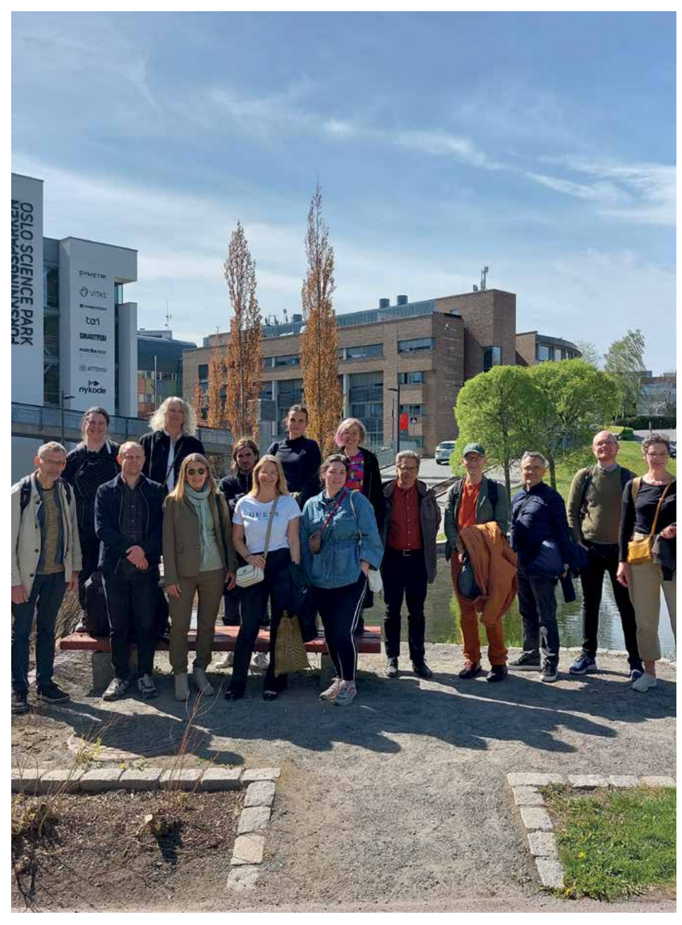
The Mistra SAMS research team on a study trip to Oslo in May 2022.